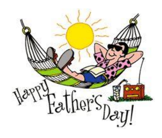
June 14 - 16 Father's Day Weekend – celebrate dad