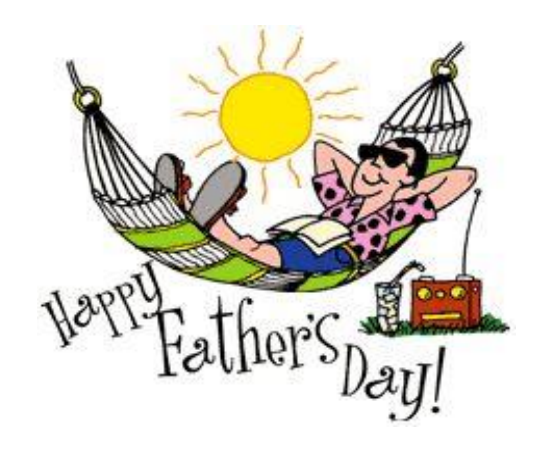
June 14 - 16 Father's Day Weekend – celebrate dad