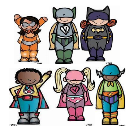
August 16 - 18

All activities, events and bands are subject to change or cancellation at any time