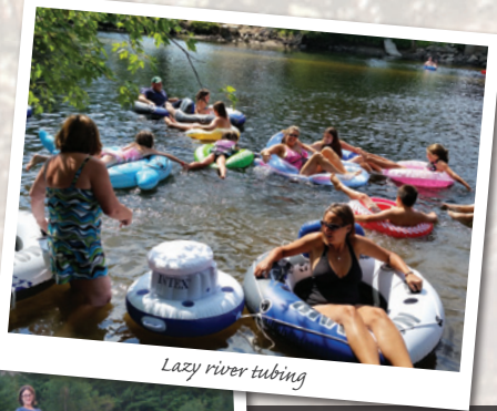
Lazy river tubing

Experience the Natural Beauty of the Adirondacks... within minutes of the Region's Major Attractions.