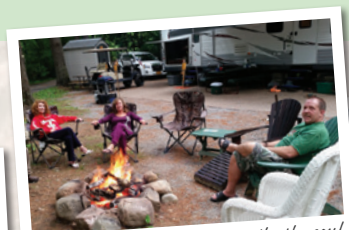
Nothing like a campfire to soothe the soul