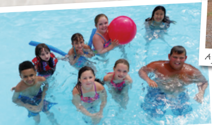
On hot days, campers enjoy cooling off in our pool