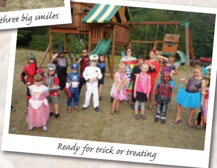
Ready for trick or treating

Directions Warrensburg Travel Park is centrally located just off the Northway (I-87), and within minutes of the region's great attractions.