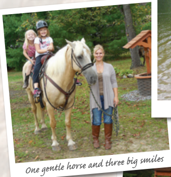
One gentle horse and three big smiles