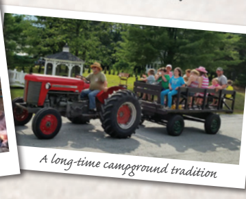
A long-time campground tradition