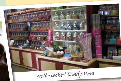
Well-stocked Candy Store