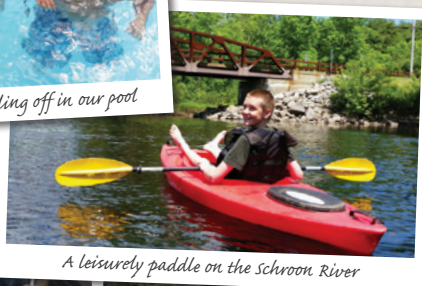
A leisurely paddle on the Schroon River