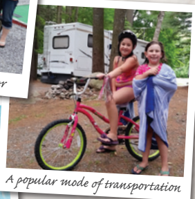
A popular mode of transportation