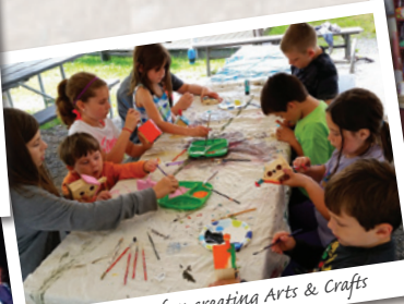
Kids have fun creating Arts & Crafts