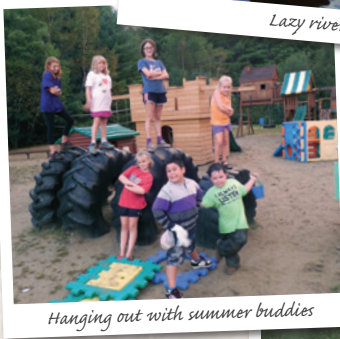
Hanging out with summer buddies