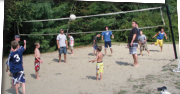
Teams battle for volleyball supremacy