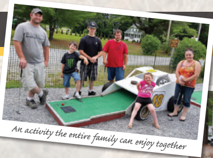
An activity the entire family can enjoy together