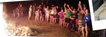
Bonfires remain part of the camping experience