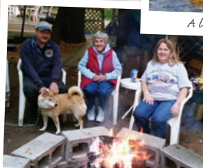
Generations of Warrensburg campers